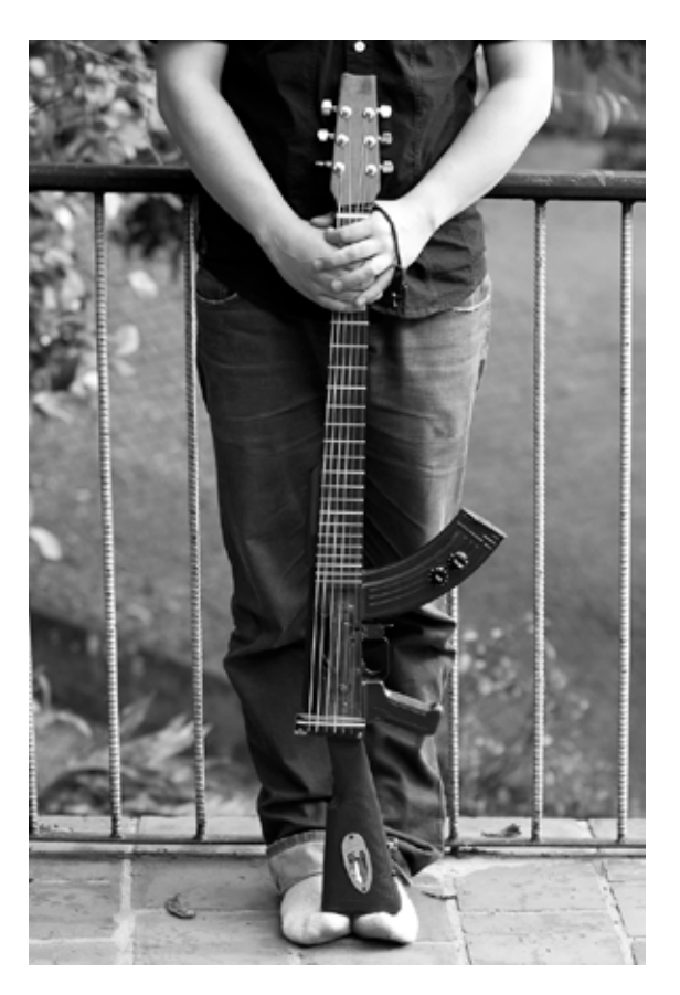
Close up of The Escopetarra.