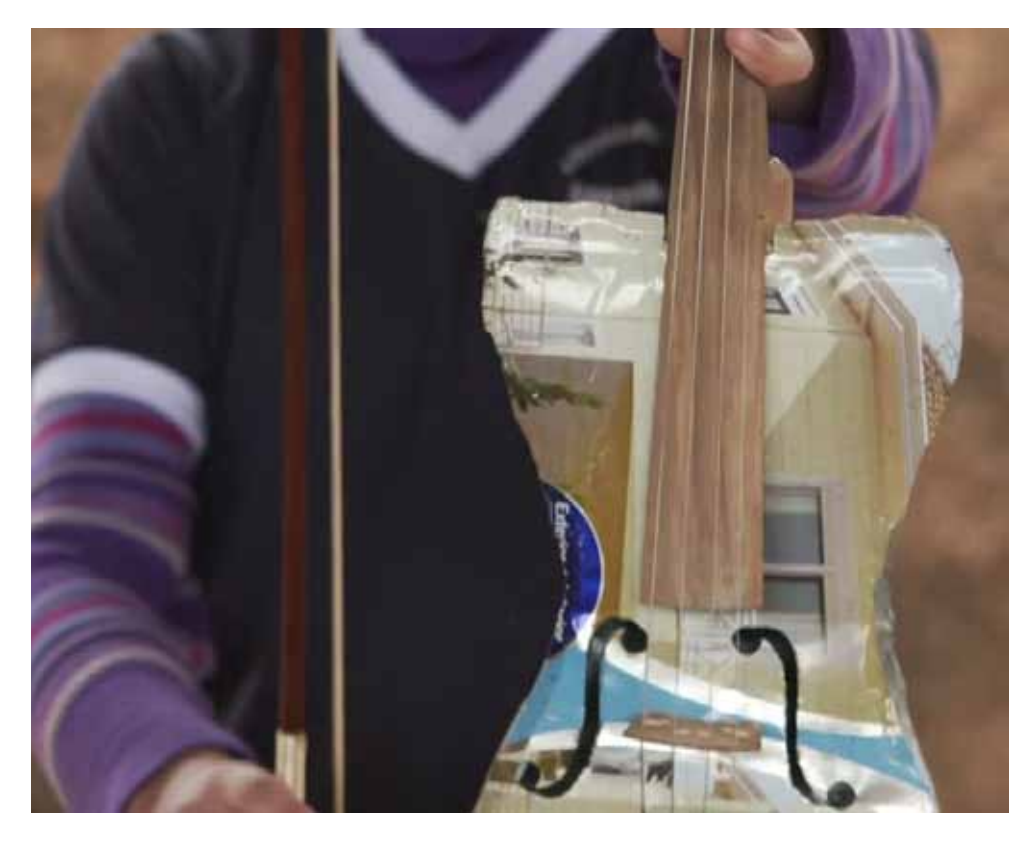
Close up of an instrument from the documentary, Landfill Harmonic.